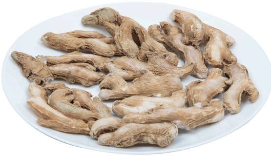
DRY GINGER DELUXE