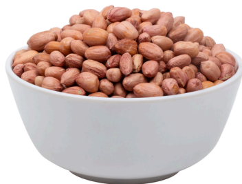
PEANUTS TJ 80/90