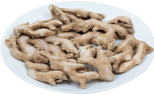
DRY GINGER PJ