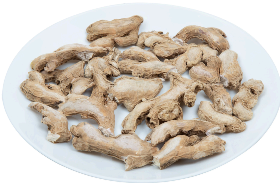
DRY GINGER A1