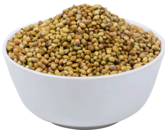
CORIANDER SEEDS SINGLE PARROT