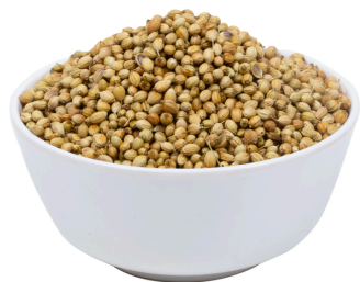
CORIANDER SEEDS EAGLE