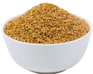
FENUGREEK SEEDS SORTEX