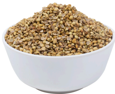
CORIANDER SEEDS SPLIT