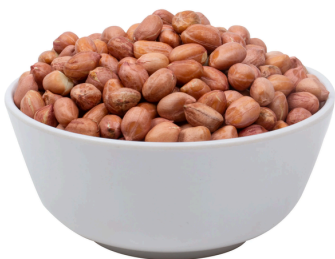
PEANUTS TJ 40/50