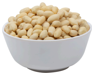
PEANUTS BALANCED WHOLE 40/50