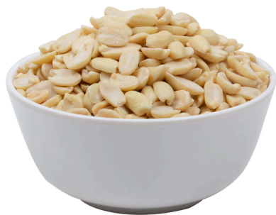
PEANUTS BALANCED SPLIT 40/50